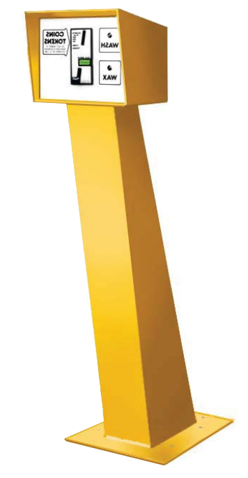
DS 20/22 Extra High Security