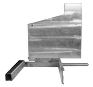
PD35 FC1L internal mechanism