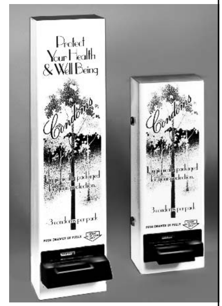
PD32LC1 PD32FC3 PD32FC1