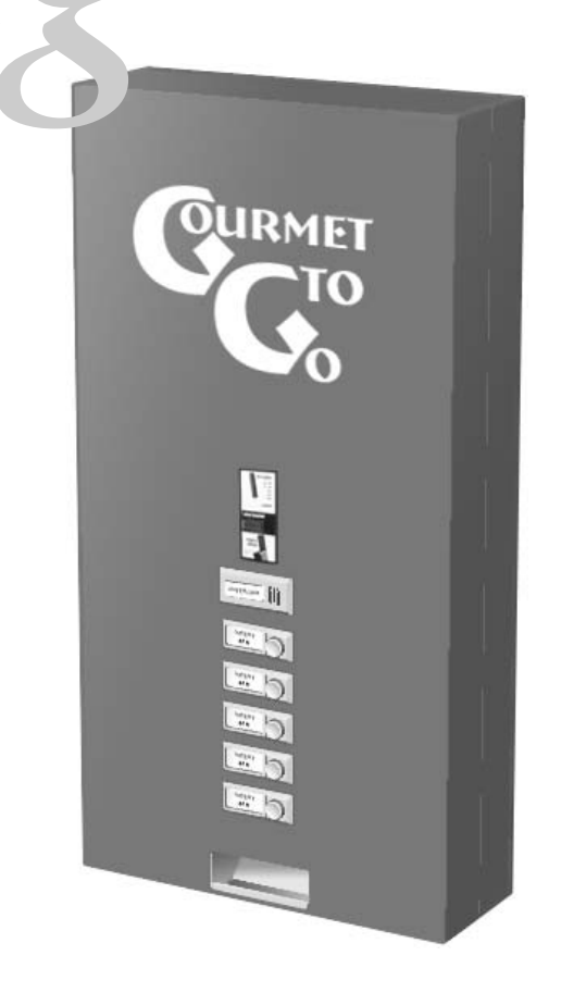
PVM4000 Typical cabinet

Abberfield have in-house design capability and full manufacturing. Vending machines to suit customers specific applications can be made to order.